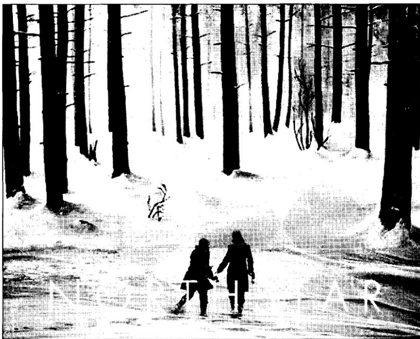
Promotional art work for the movie “Northstar” shows a winter scene. The post-apocalyptic adventure follows a group of hardened survivalists pitted against a shadowy military force. Two Iron Mountain brothers are shooting the full-length feature film in the Upper Peninsula.

Nikki Younk’s e-mail address is nyounk@ironmountaindailynews.com .